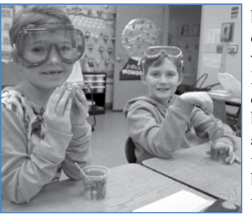
Abbey Lane students during a visit with Mad Science of Long Island.

Please remember to vote on May 15. Polls will be open from 7 a.m. to 8 p.m. at Gardiners Avenue, East Broadway, Levittown Memorial Education Center and Division Avenue High School.